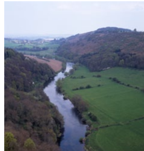
View of the River Wye from Yat Rock.