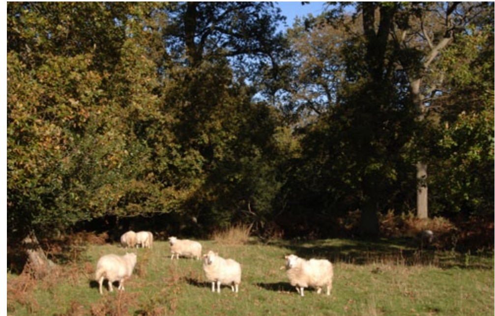
Sheep grazing the Statutory Forest, grazing animals are particularly important for maintaining the forest waste areas as open habitat.