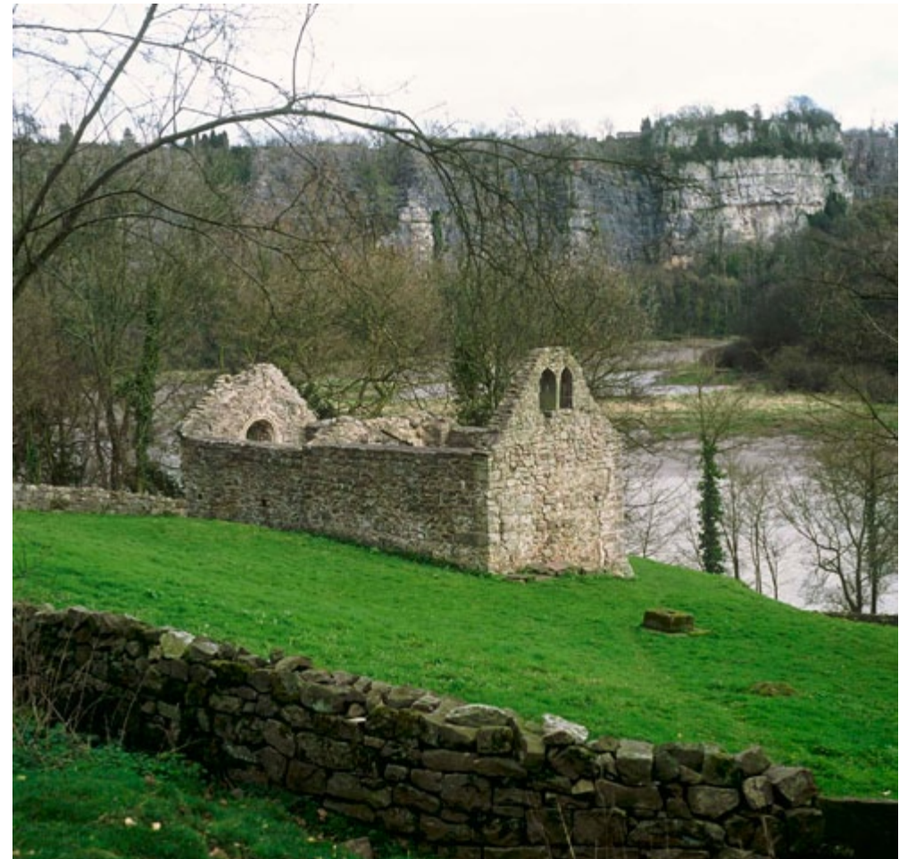
Lancaut medieval church showing the River Wye and the cliffs of Wintour's leap behind.

Industry rapidly expanded in the 16th century, and as exploitation of the coal and iron ore continued into the 17th and 18th centuries, settlements further concentrated around the edge of the statutory forest on the limestone where the iron ore deposits occurred. Most of the Wye Valley woodlands were managed as coppice to provide charcoal for the important iron industries