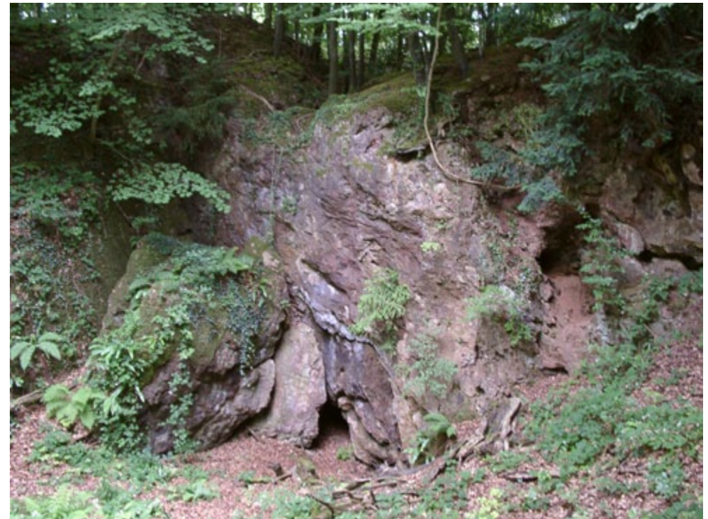
A scowel, natural cave in the 'Crease Limestone' from which iron ore was extracted.

Biodiversity and geodiversity are crucial in supporting the full range of ecosystem services provided by this landscape. Wildlife and geologically-rich landscapes are also of cultural value and are included in this section of the analysis. This analysis shows the projected impact of Statements of Environmental Opportunity on the value of nominated ecosystem services within this landscape.