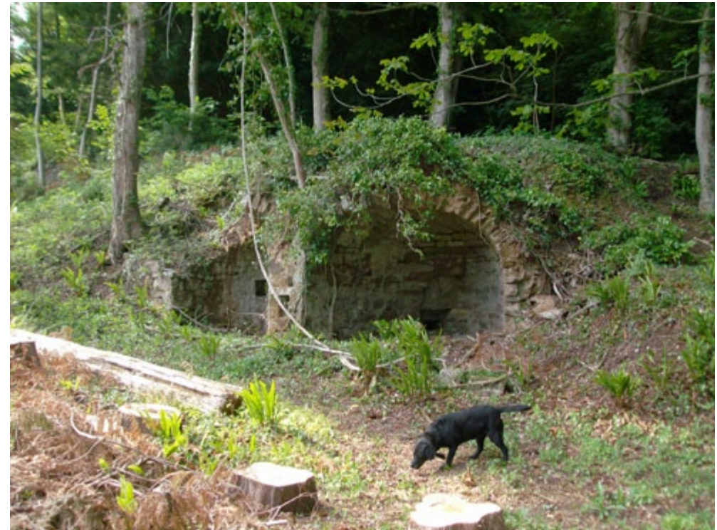
Ashwell Grove lime kiln.

To the south and west, the forested plateau opens out to a high, undulating agricultural landscape of both arable and pasture. Fields are medium-sized, and boundaries are of hedges, with only a few hedgerow trees, and discrete coniferous plantations. In places along the edge of the plateau, networks of sunken lanes, with steep banks and trees towering above, contrast markedly with the more open landscape of this part of the plateau.