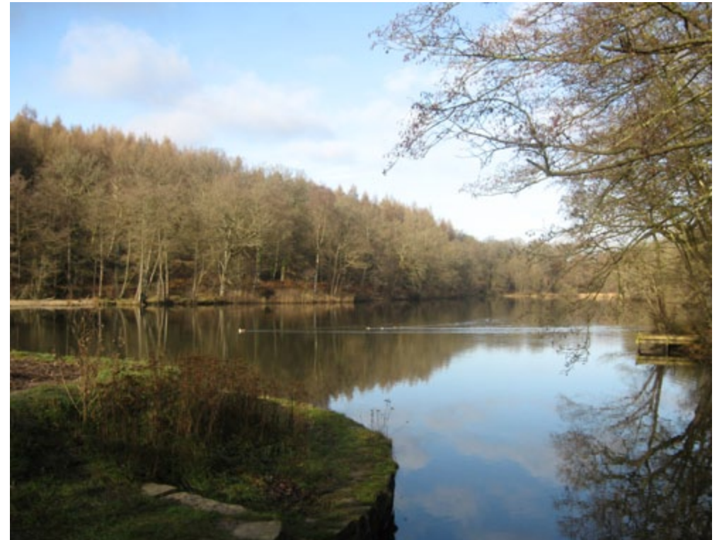
The now tranquil Cannop Ponds at one time supplied power to industrial machinery.