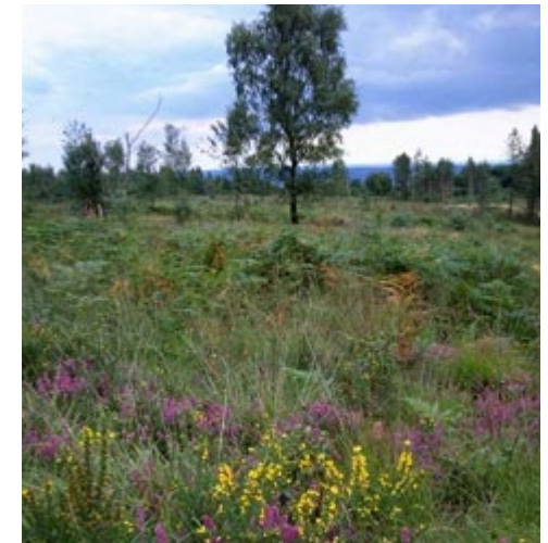
Heathland restoration at Tidenham Chase.