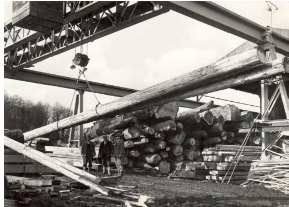
The old sawmill at Parkend.

Please note all figures contained within the report have been rounded to the nearest unit. For this reason proportion figures will not (in all) cases add up to 100%. The convention <1 has been used to denote values less than a whole unit.