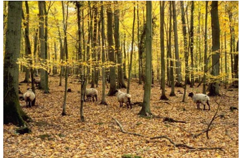
Sheep grazing in the statutory forest.