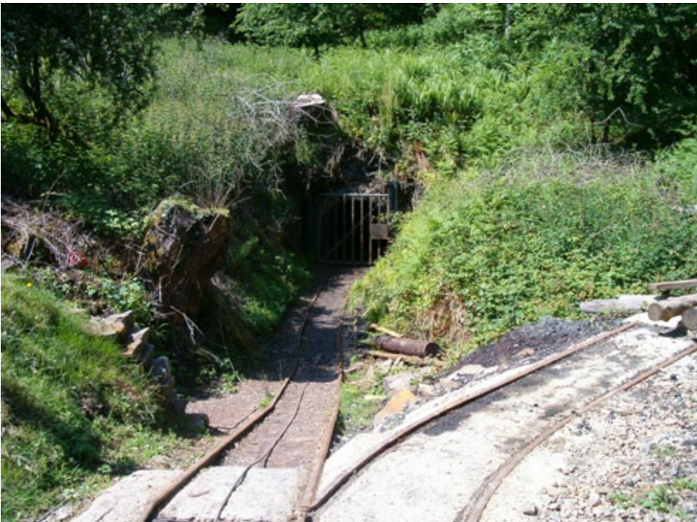
Mine entrance within the statutory forest.

The valuable timber resource was felled indiscriminately until 1668, when the Dean Forest (Reafforestation) Act resulted in the enclosure of 11,000 acres to exclude grazing animals and regenerate the dwindling woodland cover.