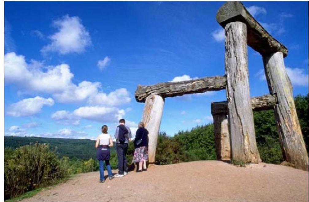
Recreation in the forest: the giants chair, part of the sculpture trail at Beechenhurst lodge.