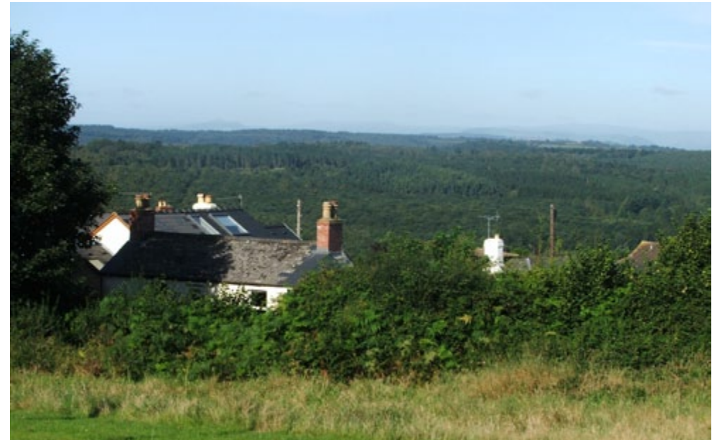
View from Cinderford across the forest to Sugerloaf Mountain far distance.

former royal hunting forest; farming; woodland management; and mineral extraction and its associated industries. Iron and coal have been exploited since pre-Roman times, with a wealth of tips; shallow, small-scale iron workings or scowles; quarry faces; horse-drawn tram roads; and disused railway lines. The area boasts 12th-century Cistercian Abbeys (for example Tintern) and associations with the Picturesque Movement.