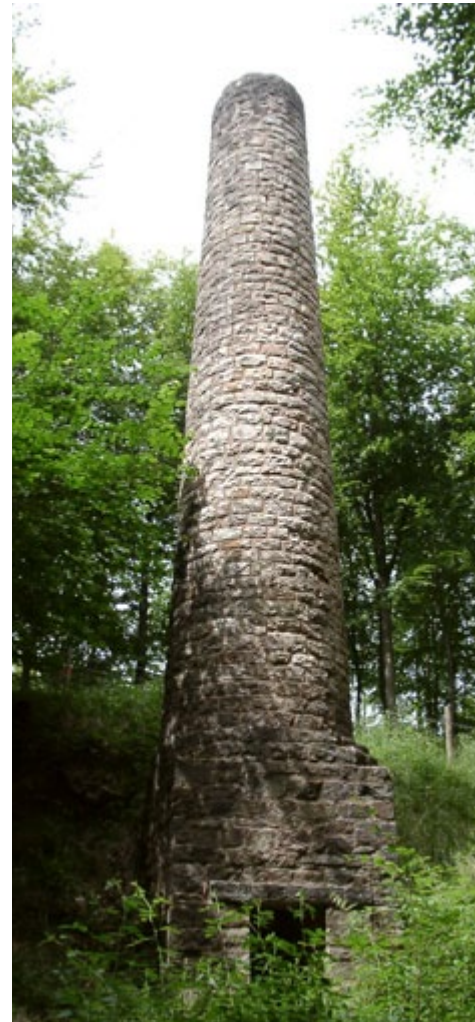
Findles Chimney at Old Staples Edge, ventilation chimney for Perseverance Iron Mine.