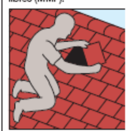
Most vulnerable: no specific group

Caused by exposure to asbestos fibres and manufactured mineral fibres (MMF).