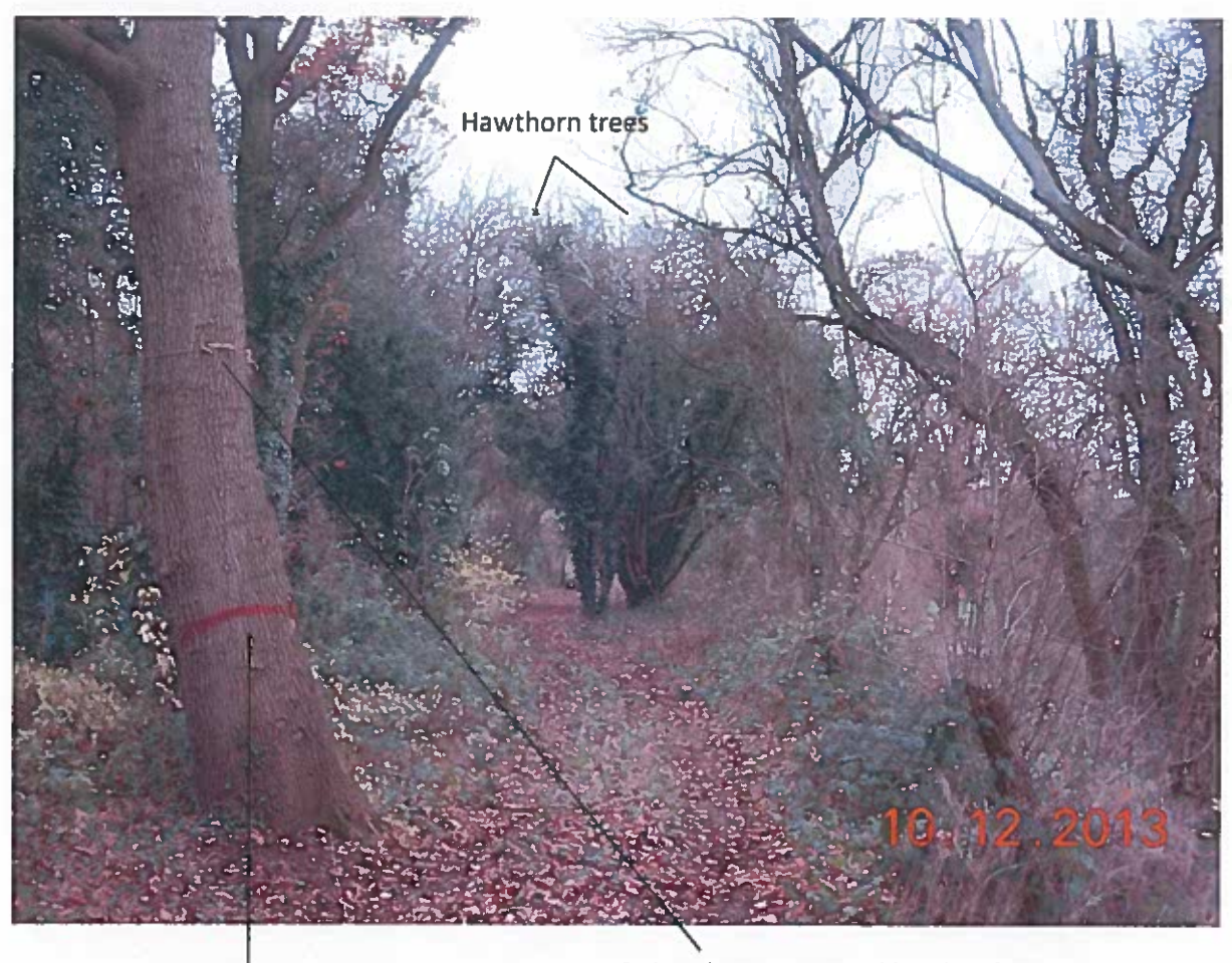
Oak marked to be felled